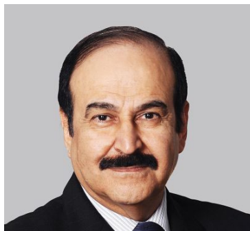
H.E. Dr. Abdul Hussain bin Ali Mirza President Sustainable Energy Authority