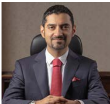
H.E. Eng. Wael bin Nasser Al Mubarak Minister, Electricity and Water Affairs